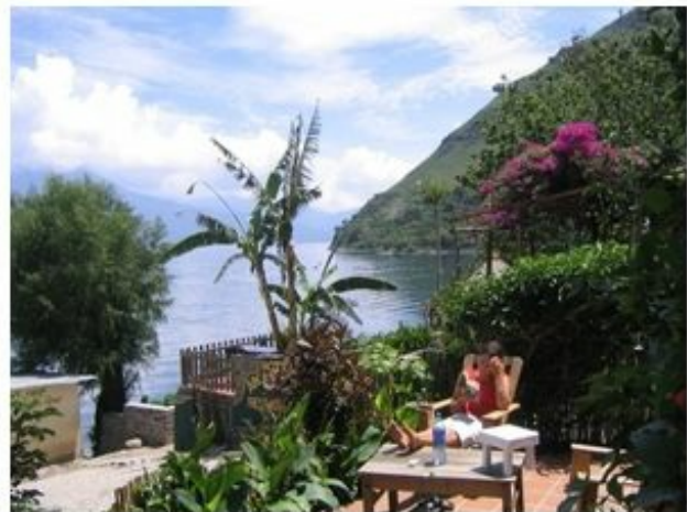
View of La Iguana Perdida Hostel

The project will feature an historic tour of Antigua Guatemala, the opportunity to develop working relationships with the people of Santa Cruz la Laguna, and great accommodations at La Iguana Perdida hostel on the shores of Lake Atitlan. We will send along a project brochure to everyone interested.