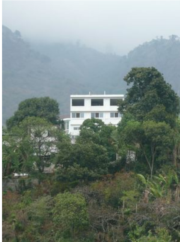
CECAP School, Santa Cruz la Laguna