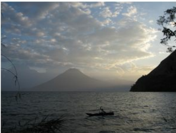
View From La Iguana Perdida Hostel

February 25 - March 3, 2012 ATC will be overseeing the design and installation of a solar photovoltaic system for the CECAP school, the Center for Vocational Education in Santa Cruz la Laguna, Guatemala. This is a project that ATC has been working on since 2009, and now we are writing to you with a unique invitation to personally take part in its final stages. As a volunteer for ATC, you will work side-by-side with ATC staff and local technical students and other village residents on a project that will improve educational outcomes and eventually help students launch social entrepreneurial ventures in the region to sell the lights on a residential and commercial scale. Not only will you have the satisfaction of knowing you are contributing to sustainable economic development and humanitarian concerns, but we have also arranged for you to learn about the culture of our Guatemalan partners on this project.