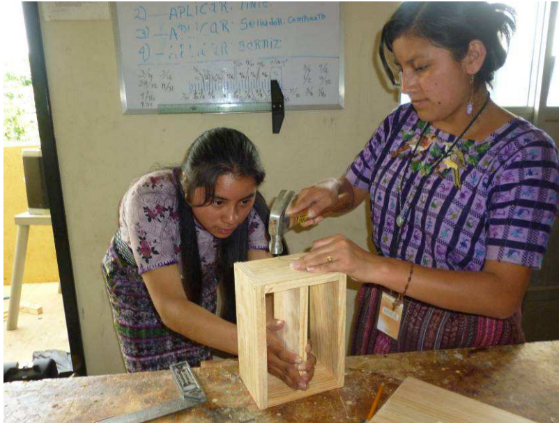
Learning Carpentry Skills