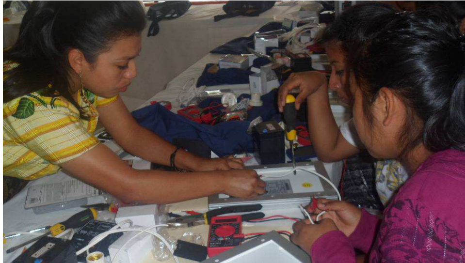
Teaching About Electricity and Solar Power