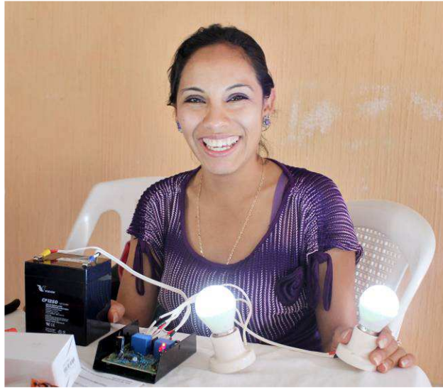
Learning About Electricity and Solar Power